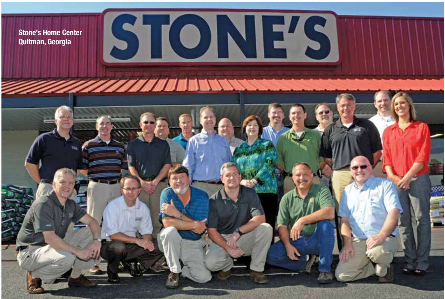
Stone's Home Center Quitman, Georgia