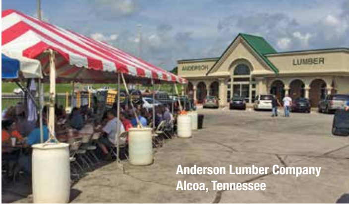
Anderson Lumber Company Alcoa, Tennessee