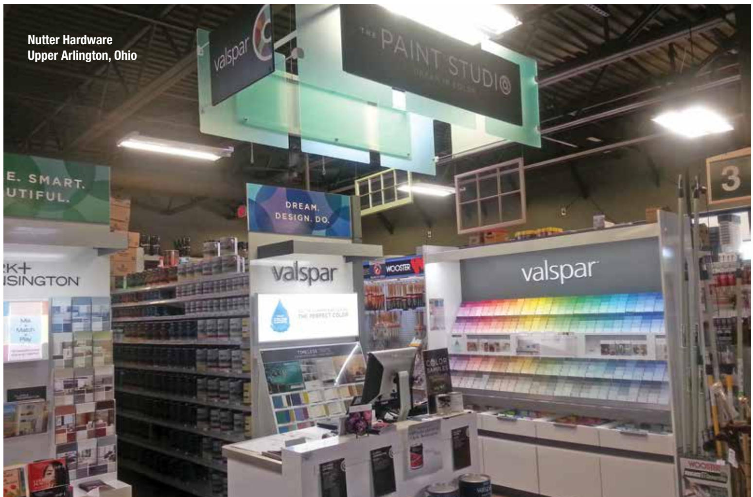
Nutter Hardware Upper Arlington, Ohio

Here's a hardware store that goes slightly beyond "general store" territory with its surprising array of product offerings. In addition to standard hardware items, The Pick & Shovel also stocks patio furniture, pet supplies, apparel, maple sugaring equipment and inventive artisanal ice cream.